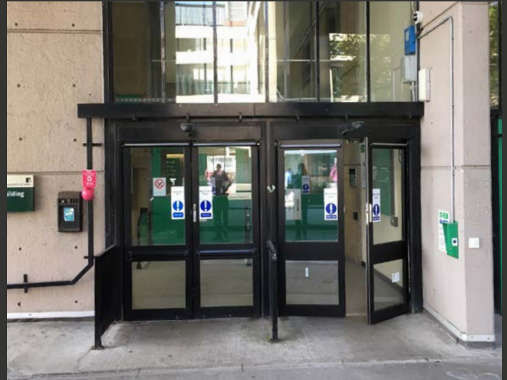
Go through double doors and take the lifts on your right-hand side to Level 10 (Red Route). Cross the aerial corridor and turn right into the EC Stoner building. Use lifts 46, 181 or 48 to access your floor.