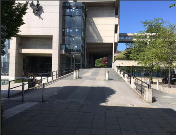
Enter Roger Stevens on Level 7 via the ramp